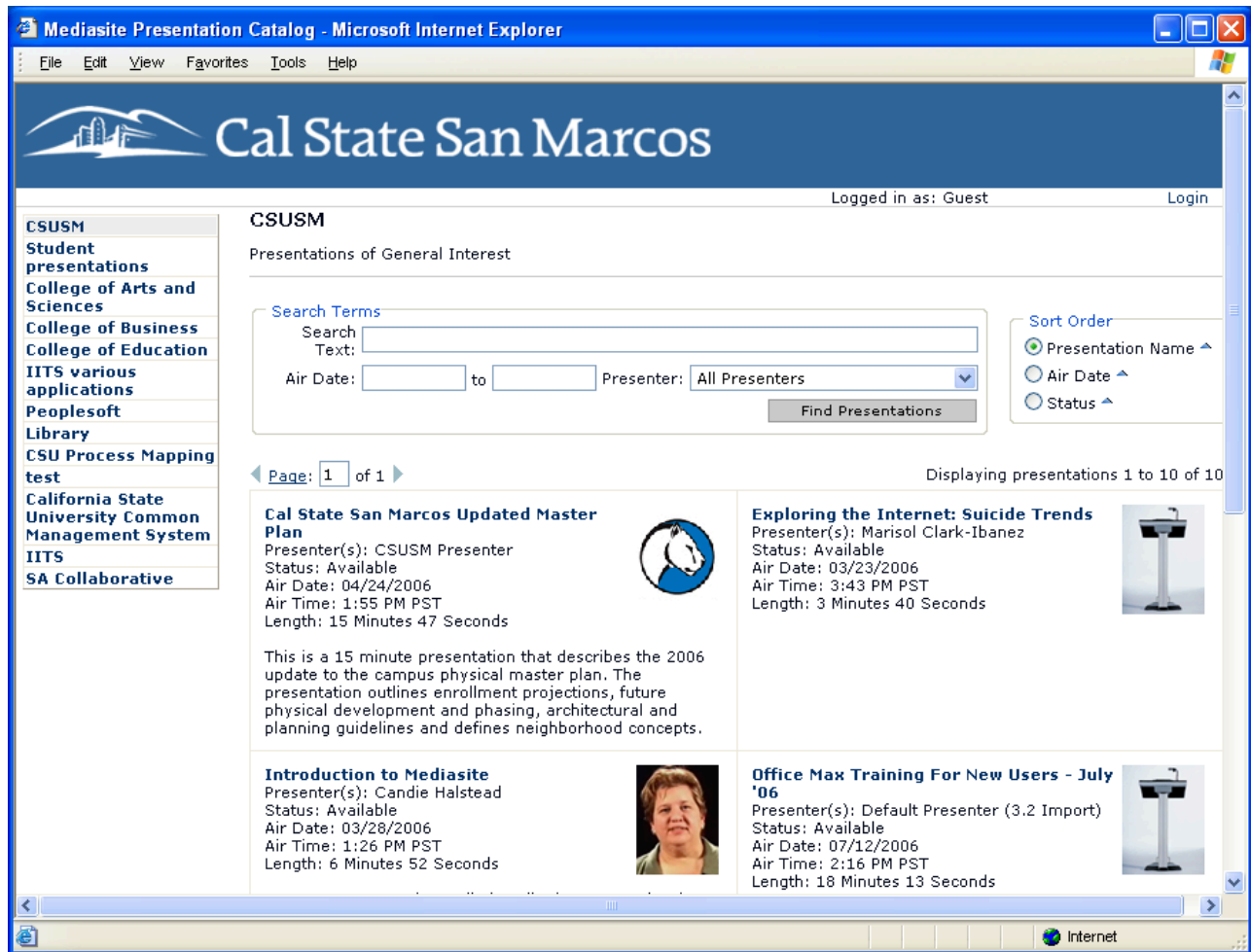
Figure 1: The CSUSM home page for Mediasite presentations

A customized skin (frame) is presented in Figure 2. Default icons are included to enable email to the presenter (ask), participate in a poll (% poll) or jump to a particular screen shot through the options at the top of the larger screen. Any number of skins can be created.