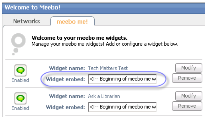
Figure 1: Copy and paste code to include widget in web page

The meebo me widget allows you to embed a chat box on your web page which will allow you to participate in a real time conversation with your site visitors. To use the widget, you must be permitted to edit the HTML for your page, and your users need to have a Flash Player (version 7.0 and above) installed on their computers.