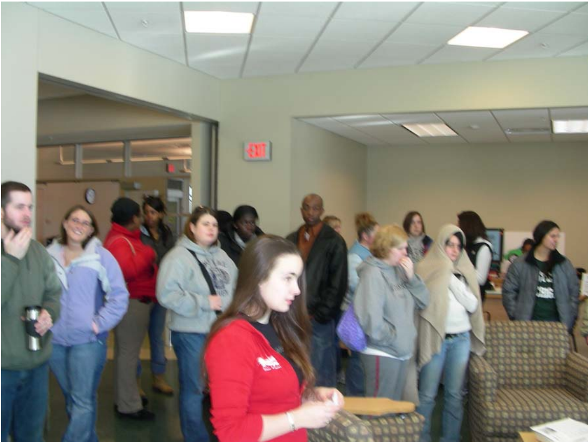
Volunteers gathering to depart for New Orleans at the Student Center.

center in 6 minivans on a mission to help rebuild part of New Orleans during our spring break. On our way to New Orleans I did not know what to expect, however I was under the impression that because it has been a year and a half after Hurricane Katrina struck, the living conditions in the area would be much better now. In addition, there has been little to no media coverage on the condition of New Orleans, and this must mean that the circumstances in this area have drastically improved.