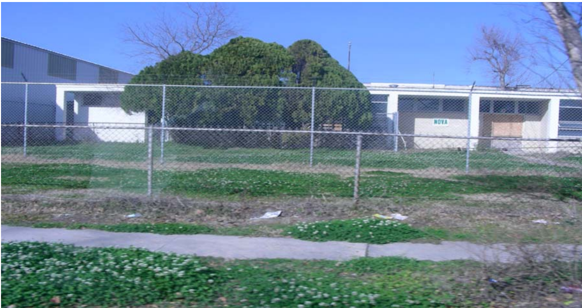
A boarded up school in New Orleans

perseverance exemplified by the residents who are affected by Hurricane Katrina, and highlighted the horrendous living conditions that are still being endured due to slow or non-existing governmental assistance.