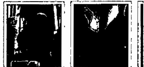
Figure 4: Patience's Backpage Ad. This is an example of a Backpage ad featuring seductive images.