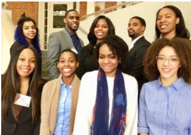
McNair Interns at the University of Maryland