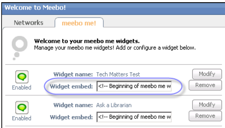
Figure 1: Copy and paste code to include widget in web page

The meebo me widget allows you to embed a chat box on your web page which will allow you to participate in a real time conversation with your site visitors. To use the widget, you must be permitted to edit the HTML for your page, and your users need to have a Flash Player (version 7.0 and above) installed on their computers.