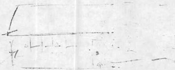
Diagram bird's-eye view of shape of building and orientation to road; use dotted lines for roof ridges. If a farmstead, diagram location and orientation to road of outbuildings:

Diagram front elevation of building showing location of doors, windows, dormers, porches, etc.: