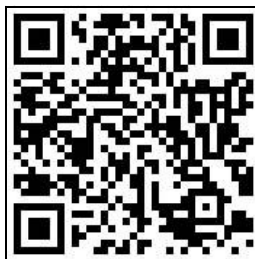
Figure 1: QR Code - Try Me to go to a LOEX web page!

Basically, QR codes can be used anytime you want to direct users to information that can be accessed, used, or