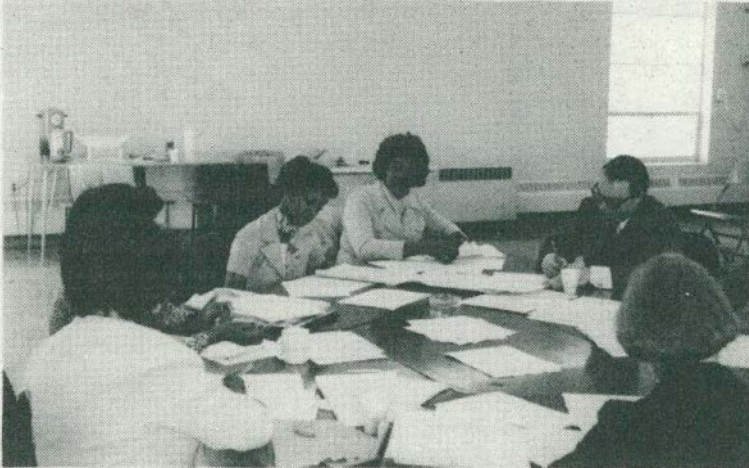
A major component of the Professional Development Program was a crucial needs-assessment process in which the individual school staffs determined what their greatest needs were.