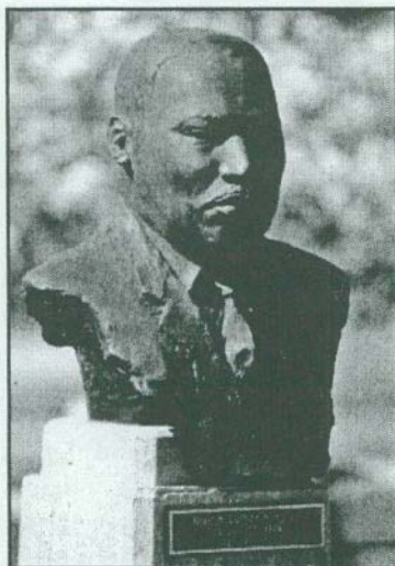
CELEBRATING KING: Eastern Michigan University will remember Dr. Martin Luther King, Jr. with a number of events Jan. 19.

be present for a question-and-answer session following the theatre department's production of her play, "In the Blood."