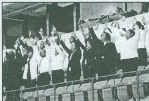
HALLELUJAH: The EMU Gospel Choir performs prior to the MLK Luncheon last year.